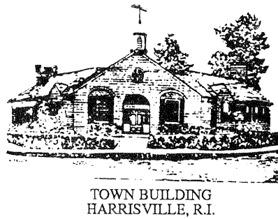
TOWN BUILDING HARRISVILLE, R.I.

TOWN OF BURRILLVILLE 105 Harrisville Main Street Harrisville, Rhode Island 02830